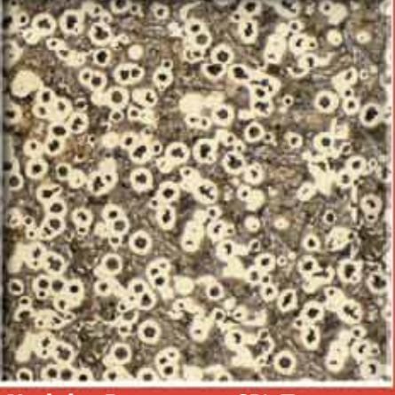
Attack Nital 4%